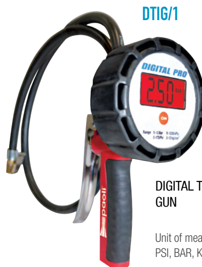
DIGITAL TYRE-INFLATING GUN

Unit of measure: PSI, BAR, Kpa, Kg / cm 2